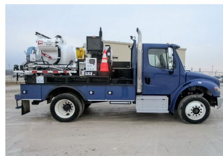
Improve your water distribution system reliability today with a Wachs Valve Maintenance System