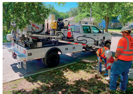
The Standard LX skid can be mounted on trucks from a medium duty flatbed up to a heavy-duty custom service body