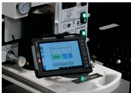
The ruggedized TC-100 handheld computer / wireless controller / datalogger provides intuitive remote exerciser control