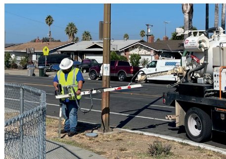
With the ERV-750 extended reach valve exerciser an operator can turn multiple nearby valves without moving the vehicle